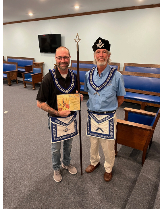
David A Polson Rookie Award