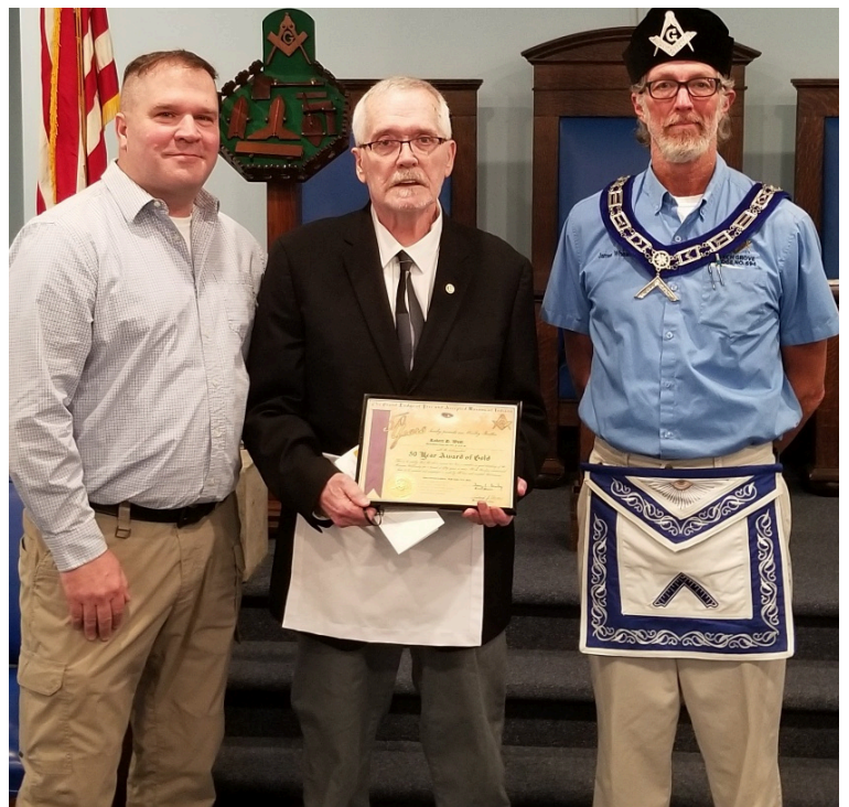
Robert D. West 50 Year Award